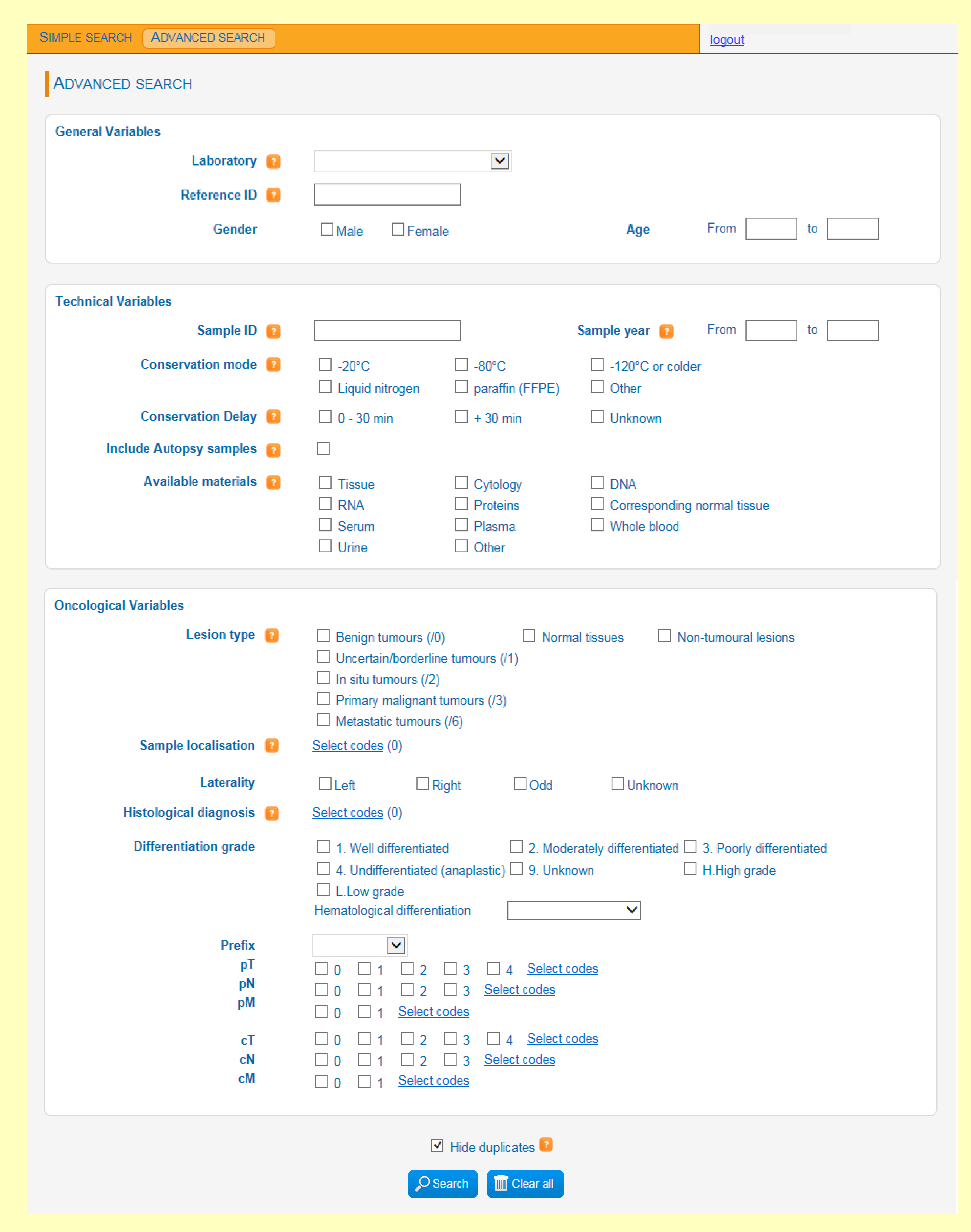
Figure 2. Belgian Virtual Tumourbank Catalogue: the advanced search allows researchers to query data on basis of general, patient, technical and medical variables. Next to the advanced search, the catalogue also offers a simple search.